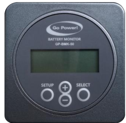
GP-BMK-50 BATTERY MONITOR

The management system governing the manufacture of this product is ISO 90001:2008 certified.