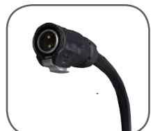
XLR-style solar plug