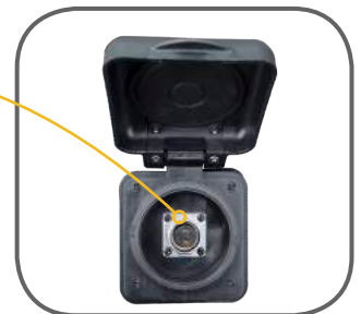
Connects to XLR-style solar ports, such as the Furrion solar port.