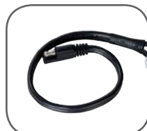
SAE solar plug adapter