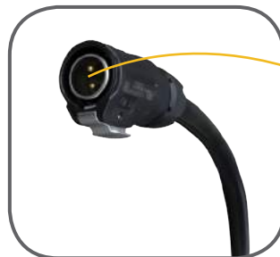
XLR-style solar plug