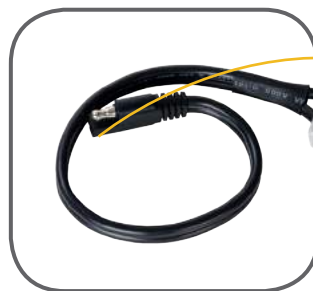
SAE solar plug adapter